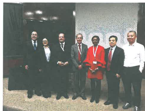
Chinese and Mozambique's specialists in South Africa